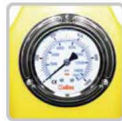
● Pressure Gauge