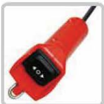
● Optional remote controller, shall order separately.